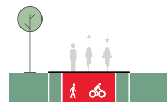
Potential cross section of the key regional route along the rail corridor